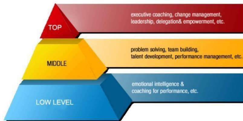
LEVELS OF MANAGEMENT

Comparison of actual performance with the standards and finding out deviation if any.